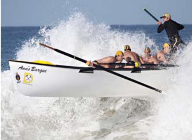
Take off ... this Cottesloe crew tries to defy gravity.