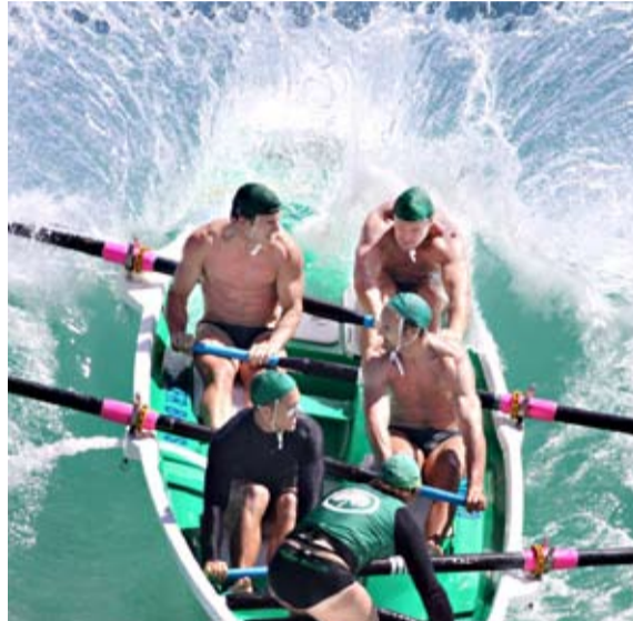
Dash and splash ... Palm Beach rowers in action.