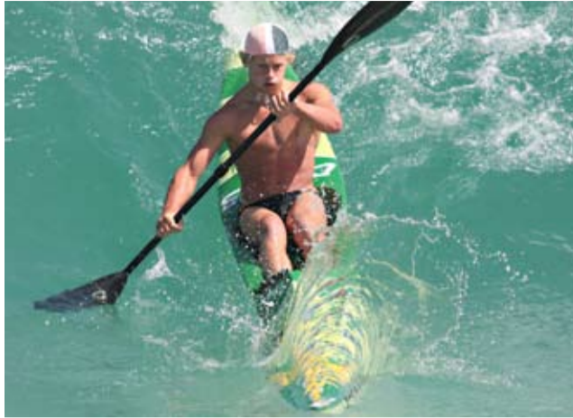
Nosedive ... A Warilla/BP paddler about to get wet.