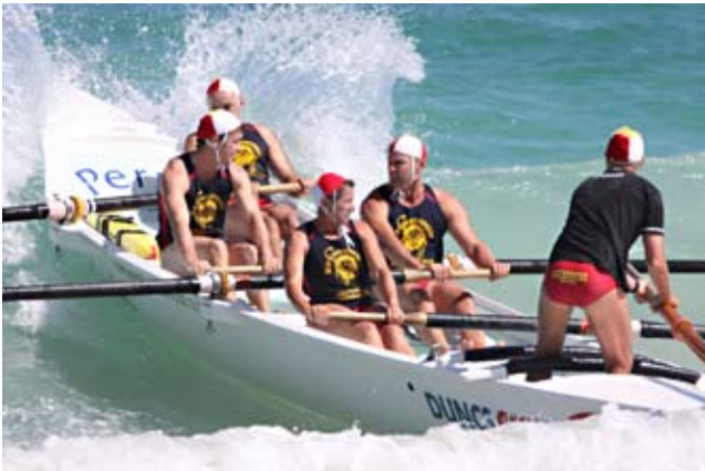
Shining bright ... Esperance Goldfields hit the break.