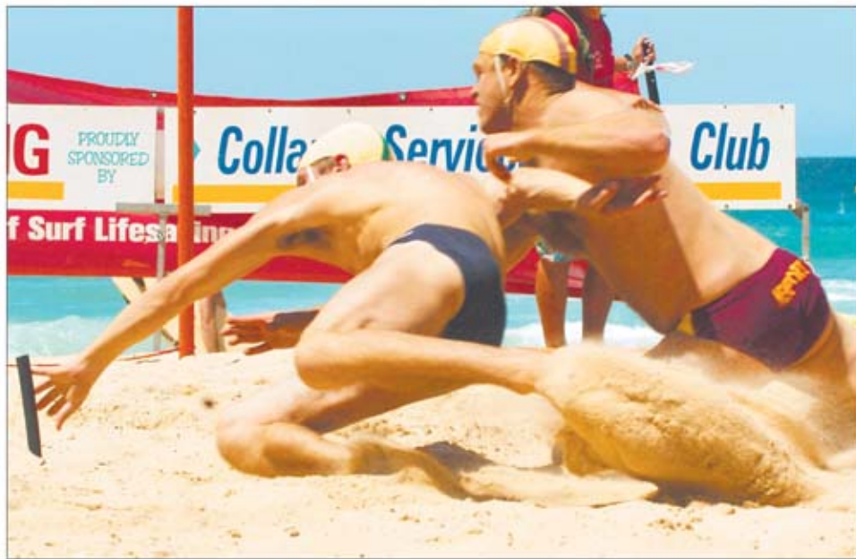
The sand flies – and so do the bodies – in a desperately tight finish at Manly.