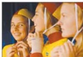
Queenscliff members prepare for the start of a new season.