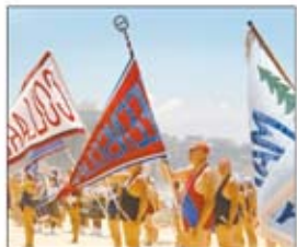
The march past at Manly Beach.