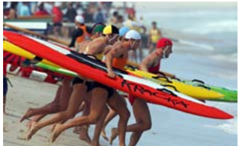
On your marks ... The open board race.