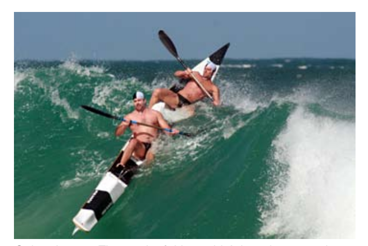
Going down ... The result of this couldn't have been good.