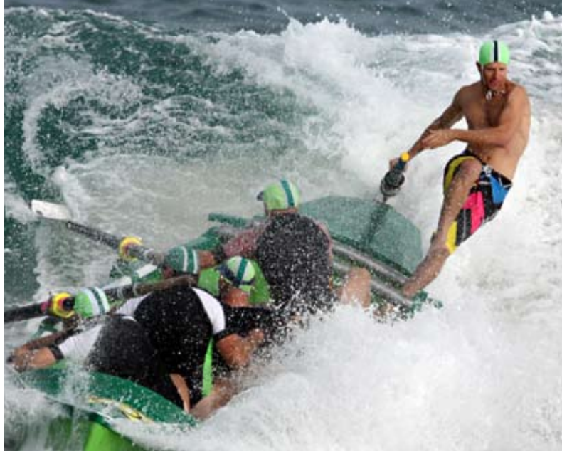
Stepping out ... Sorrento get into trouble in a Masters boat race.