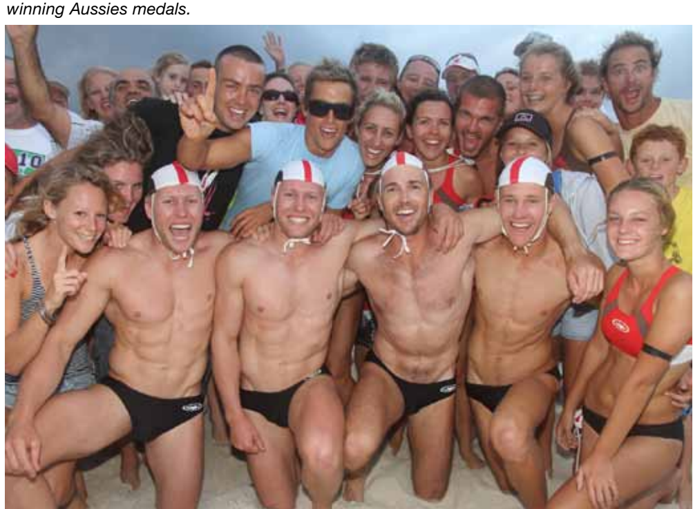
SKI SPRINTERS: North Bondi's ski paddlers turned sprinters finished seventh in yesterday's final but were happy to celebrate with family and friends.